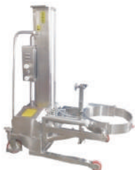
Drum Lifter & Tilter