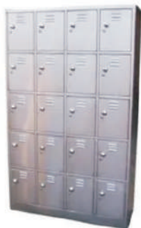
20 Compartment SS Locker