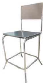
SS Fix Chair