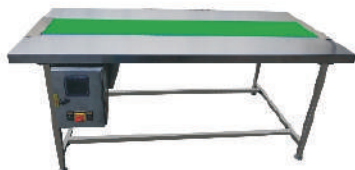
Belt Conveyor with VFD Controls