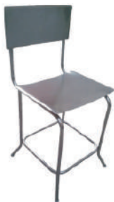
SS Tilting Chair