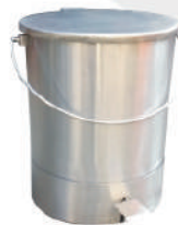
Paddle Dust Bin