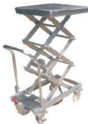
Manual 3X Scissors Lift