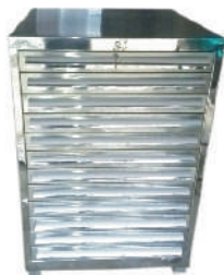
Punches & Dies Cabinet