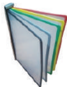
Folder Type SOP