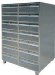
Die Punch Cabinet