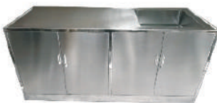
SS Sink Cabinet