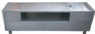
Cross Over Bench