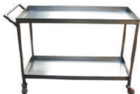
Multi Purpose Trolley