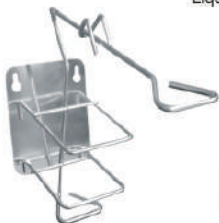
IPA Bottle Stand