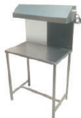
Visual Inspection Table