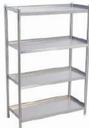
Stainless Steel Racks