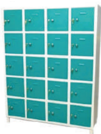
Powder Coated Personal Locker 20 Compartment